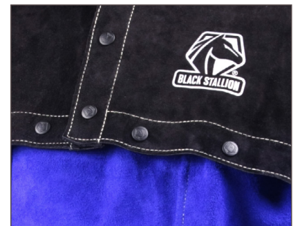
Snaps to attach to JL1021-BB Cape Sleeves