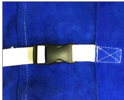
Adjustable waist strap for a secure and comfortable fit